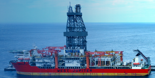
West Jupiter – Side View

The West Jupiter is a 7th generation ultra-deepwater dual activity drillship with operational history in West Africa and Brazil