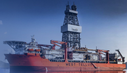
West Tellus – Side View

The West Tellus is a 7th generation ultra-deepwater dual activity drillship with operational history in Brazil.