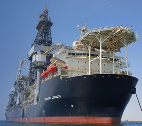
Sonangol Libongos – Side View

The Sonangol Libongos is a 7th generation ultra-deepwater dual activity drillship with operational history in West Africa.