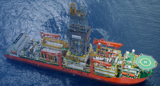
West Vela – Side View

The West Vela is a 7th generation ultra-deepwater dual activity drillship with operational history in the U.S. Gulf of Mexico.